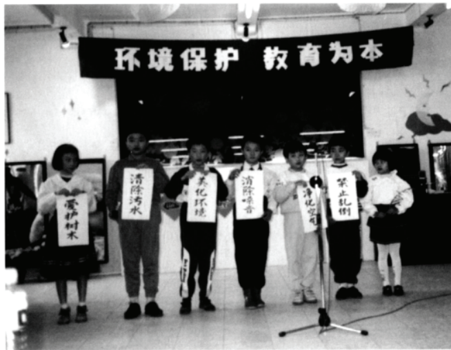
Figure 1: 'Environment Show': Students displayed their environmental slogans

He pointed out the role of Chinese in keeping the environment as a 'national duty'. Here, environmental education started to be incorporated with mass media, for instance, the government-owned national newspaper, Xin Hua. Promotion made in the mass media was mainly to strengthen the aforementioned idea, that environmental education is people's duty as citizens than people's awareness to the current environmental condition.