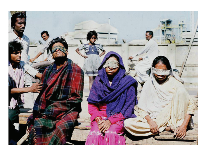
Figure 2: A photo from Bhopal tragedy in December 1984 showing victims lost sight after the poison gas leak from the US Union Carbide factory

Iyengar and Bajaj examined state syllabi composed by Madhya Pradesh state in respect to environmental education and compared it with the National Board syllabi which uses Central Board of Secondary Education (CBSE) materials. Historically, ancient Hindu texts point out the notion of environmental protection, for instance, moderate use of natural resources and live in harmony with other living creatures. Gandhi, the father of modern Indian movement, also put emphasis on respecting the nature within his thoughts and examples. Indian's education previously placed environmental education merely as a science, meaning that issues on environmental protection was never be a part in class discussion. As a follow-up action after Stockholm summit in 1972, the Indian government adopted a national policy on environmental education in its school and college curricula. However, it took years to make environmental education a mandatory subject, officially in December 2003.