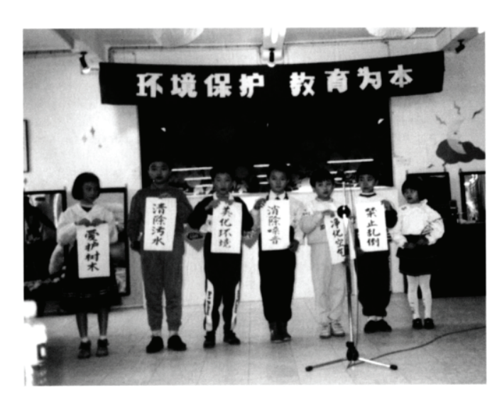
Figure 1: 'Environment Show': Students displayed their environmental slogans

He pointed out the role of Chinese in keeping the environment as a 'national duty'. Here, environmental education started to be incorporated with mass media, for instance, the government-owned national newspaper, Xin Hua. Promotion made in the mass media was mainly to strengthen the aforementioned idea, that environmental education is people's duty as citizens than people's awareness to the current environmental condition.