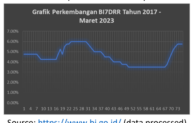
Figure 2. BI Rate Development Chart January 2017-March 2023

BI Rate is a benchmark interest rate policy issued by Bank Indonesia which is used to maintain harmony between the volatility of operational interest rates and the achievement of inflation targets (Tumundo & Dkk, 2020). For an investor in choosing the type of investment, interest rates are also one of the things that influence. Where the movement of the benchmark interest rate can affect deposit and credit interest rates in the community. If the deposit interest rate is high, then investors will tend to invest their capital in the form of deposits, this is felt by investors because it produces a large return.