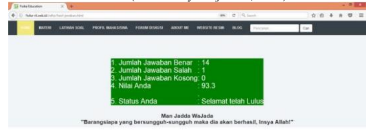
Figure 3. The display of student exercises