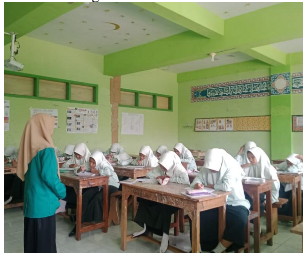
Figure 1. Implementation of Research

31 totaling 25 students as the control class. The experimental class is the class that is given the treatment and the control class is the class that is not given the treatment. The sample was taken through recommendations from the VII grade tutor at MTs Darul Huda Ponorogo.