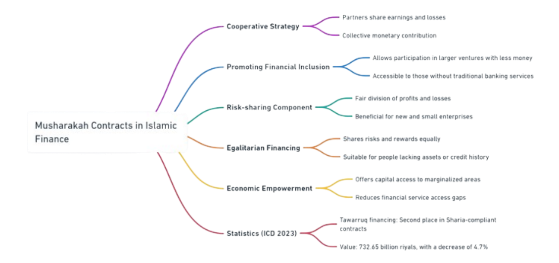
Figure 3: Musharakah Contract for Financial Inclusion Tools

Musharakah can be a more egalitarian kind of financing since it involves sharing risks and rewards, especially for people who do not have enough assets or credit history to qualify for traditional loans. A musharakah contract can give people and companies, especially those in marginalised or underprivileged areas, the chance to get capital for investments or economic endeavours. This can lessen gaps in access to financial services and encourage economic empowerment. In Saudia, Tawarruq financing came in second place for financing contracts compatible with the provisions and principles of Sharia in the Kingdom (representing 36.06%). Its value reached 732.65 billion riyals at the end of the first quarter of 2023, recording a decrease of 4.7%, equivalent to 36.06 billion riyals, compared to its value at the end of the same quarter of last year, which amounted to 768.7 billion riyals<sup>51</sup>.