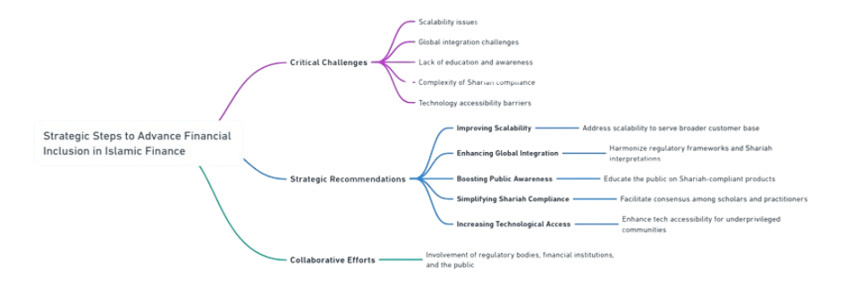
Figure 6. Strategic Steps to Advance Financial Inclusion

<u>Figure 6</u> shows that Islamic finance faces several critical challenges that need to be addressed for sustained growth. These include scalability issues of its financial products and the challenge of achieving global integration. While traditional financial systems achieve economies of scale, Islamic banking struggles to do so, limiting its ability to serve a broader customer base. The integration of Islamic financial systems into the global market may be hindered by the varying regulatory frameworks and interpretations of Shariah principles across borders.