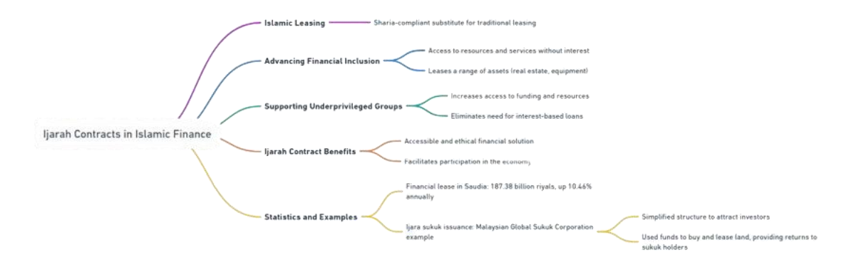
Figure 4: Ijarah Contract for Financial Inclusion Tools

of society to participate in the economy. To connect the 'Ijarah Contract' to financial inclusion, it is important to recognize its potential as a means of increasing access to resources and funding, especially for underprivileged or marginalized groups.