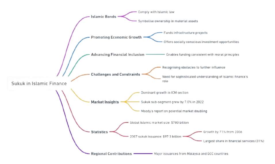
Figure 5: Sukuk Contract for Financial Inclusion Tools

<u>Figure 5</u> illustrates sukuk, or Islamic bonds, that conform to Islamic law as property rights. These financial instruments provide an inclusive investment opportunity by allowing anyone to fund initiatives that align with moral principles and Sharia law. Sukuk are crucial for financing infrastructure projects, promoting economic growth, and providing socially responsible investment options.