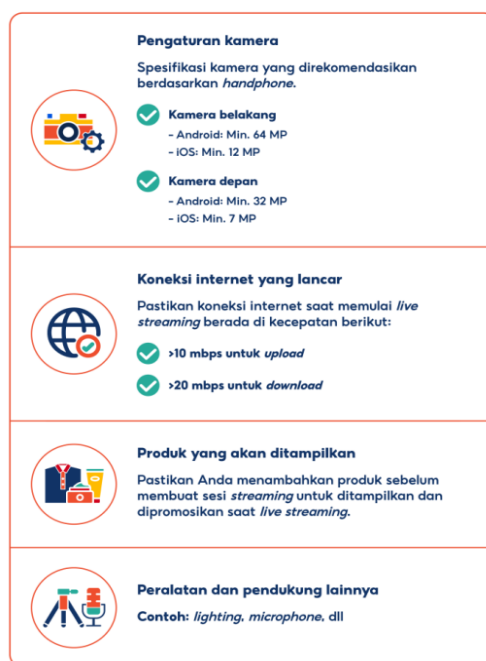
Figure 1. Streaming Equipment 23

carts can only come from the store itself. There are provisions regarding content, minor, and serious violations. The streaming preparation process consists of the streaming equipment that must be prepared, the concept of streaming, titles and covers, and the media used.