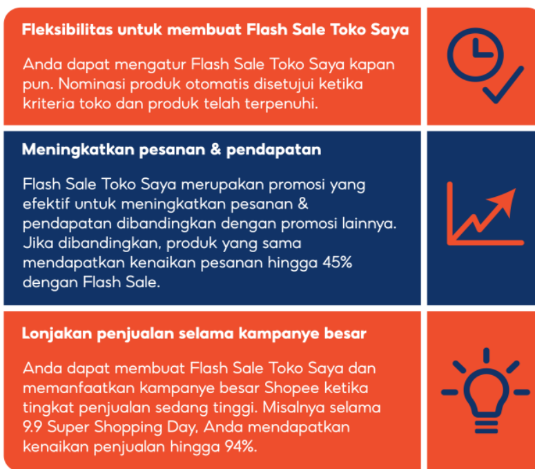
Figure 3. Benefits of Toko Saya Flash Sale for Seller on the Shopee Platform 29

The regulation and management of Toko Saya flash sales are entirely overseen by sellers who satisfy the specified conditions for Shopee. These sellers have the discretion to decide on the items they wish to present in the Toko Saya flash sale and are free to determine their prices, discounts, and promotions. Furthermore, there are several advantages of using Toko Saya flash sales for sellers on Shopee, such as the ability to create and customize sales, increase sales revenue, and capitalize on sales spikes during large-scale campaigns. Figure 3 illustrates the benefits of using Toko Saya flash sales for Shopee sellers.