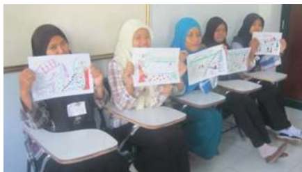
Picture 5 Unforgettable Holiday in Grandfather's House Picture 6 Presentation on Unforgettable Holiday in Bali

The fourth observation was conducted on Monday, 15 th of June, 2015 at fist period at Watoe Dakon Basement. 19 students were present. Today's project was drama performance. The lecturer assigned the students to prepare themselves for performing drama two weeks before. They had to work in group in discussing the topic or the story they wanted to perform. They set up the scenario or wrote the script for drama performance. The performance was in the following: