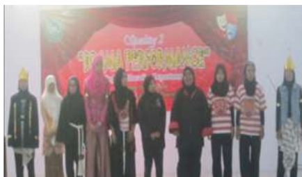
Picture 7 'The Legend of Ponorogo" Picture 8 'The Legend of Lutung Kasarung

The researcher interviewed the lecturer and some students in order to find the related information dealing with the implementation of Project-Based Learning. The interview was conducted after observations were carried out.