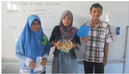
Picture 3. How To Make Tofu Ball