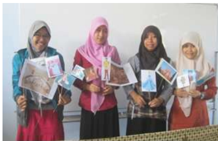
Picture 1. The puppet of Cinderella Story Picture 2. The puppets of Ande-Ande Lumut Story

The second observation was conducted on Monday, 1 st of June, 2015 at fist period at AG Building. 20 students were present. The media used were real object – traditional food. The material was in the form of Procedure Text – How to make something. The generic structure and features of procedure text was also given. The lecturer told the students that the project for today's meeting was doing oral presentation on how to make food. She asked the students to submit