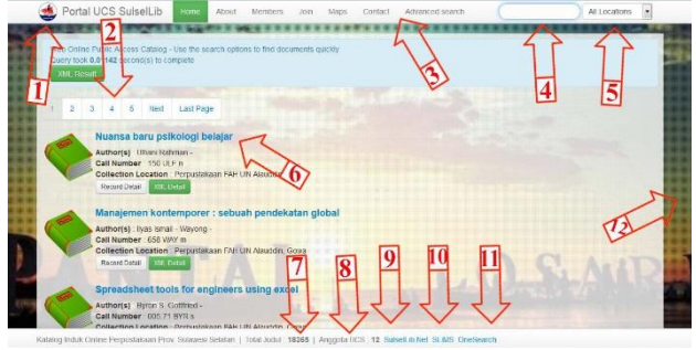
Figure 2 : Portal UCS Sulsellib Interface

Even though this portal interface display design is not prioritized, but SLiMS Community still consider the aesthetic value so that users do not feel bored when they access portal.