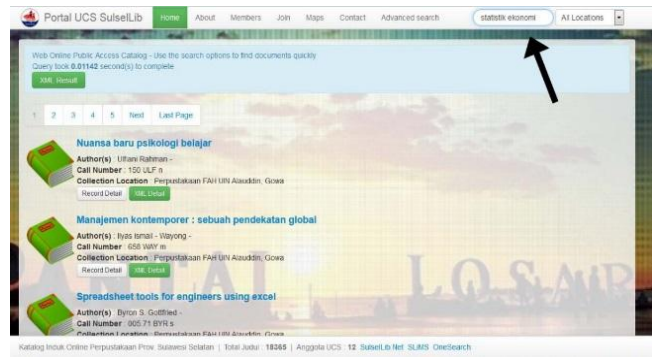
Figure 6: Book Search

The training which is carried out by SLiMSCommunity isabout the way of using that Portal UCS Sulsellib, like in search of abook.