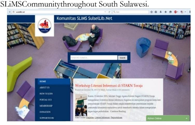
Figure 5: Sulsellib.net Website

Besides Facebook, SLiMS Community also does promotion using the website of SulsellibSLiMSCommunity, which its web address is, <a href="http://www.sulsellib.net/">http://www.sulsellib.net/</a>. The website contains articles about library and literature. This website also contains areport of activities done by