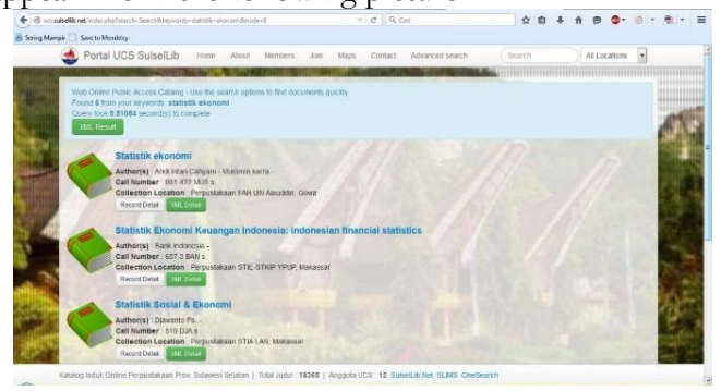
Figure 7: Result of Book Search

Just by typing the keyword book title on thesearch box, and pressing the enter button, the result of thesearch will appear like in the following picture.