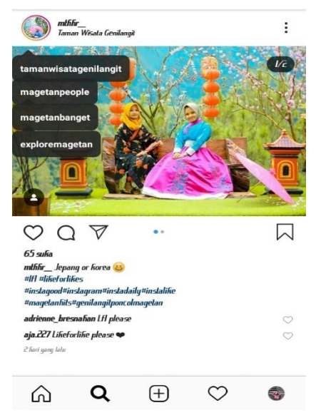
Figure 4.4 Use of the Geotag feature in Geni Langit Park Visitor Posts

Among Instagram activities that can be done: