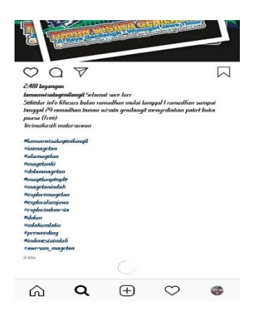
Figure 4.2 Use of Hashtags on Social Media Posts of Geni Langit Park