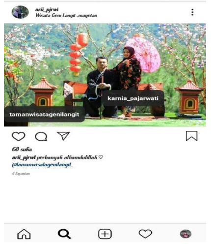
Figure 4.3 Geotag feature usage in Geni Langit Park Visitor Posts

Adding geotags can be done by activating GPS permissions on smartphones for the Instagram application, to find location options when posting content. By adding a tag to each post, the existence of Geni Langit Park will be better known by the wider community. According to the researchers' observations, many visitors to the Geni Langit Tourism Park include geotags in each of their posts. This is evidenced by the number of posts that enter the profile of the Geni Langit Tourism Park as follows: