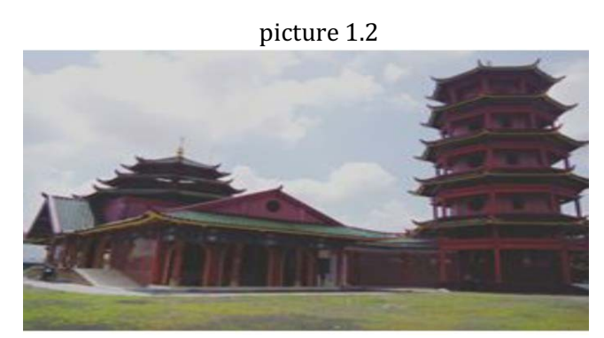
The colors of Muhammad Cheng Hoo Mosque Jember

As for if it is applied to the architecture of the Muhammad Cheng Hoo mosque in Sempusari, Jember as follows.