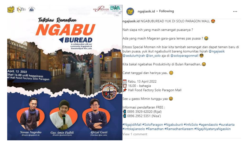
Fig1. Example Picture of Hijrah Community's @ngajiasik.id Activity

The hijrah community @ngajiasik.id plays a role in mobilizing the community to provide a means of improving the quality of people's faith and spreading Islamic da'wah widely. As a means of improving the quality of faith, this community holds regular Tuesday night studies. And to attract the attention of the congregation, they invited young clerics, so that the message conveyed was easily understood by the congregation.