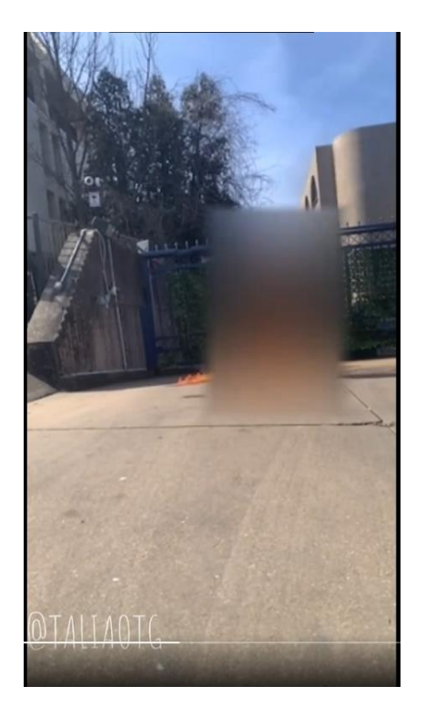
Picture 2 Tangkapan Layar Video Aaron Bushnell Meneriakkan Kalimat "Free Palestine" Sebelum Melakukan Aksi Bakar Diri pada Menit 1.30